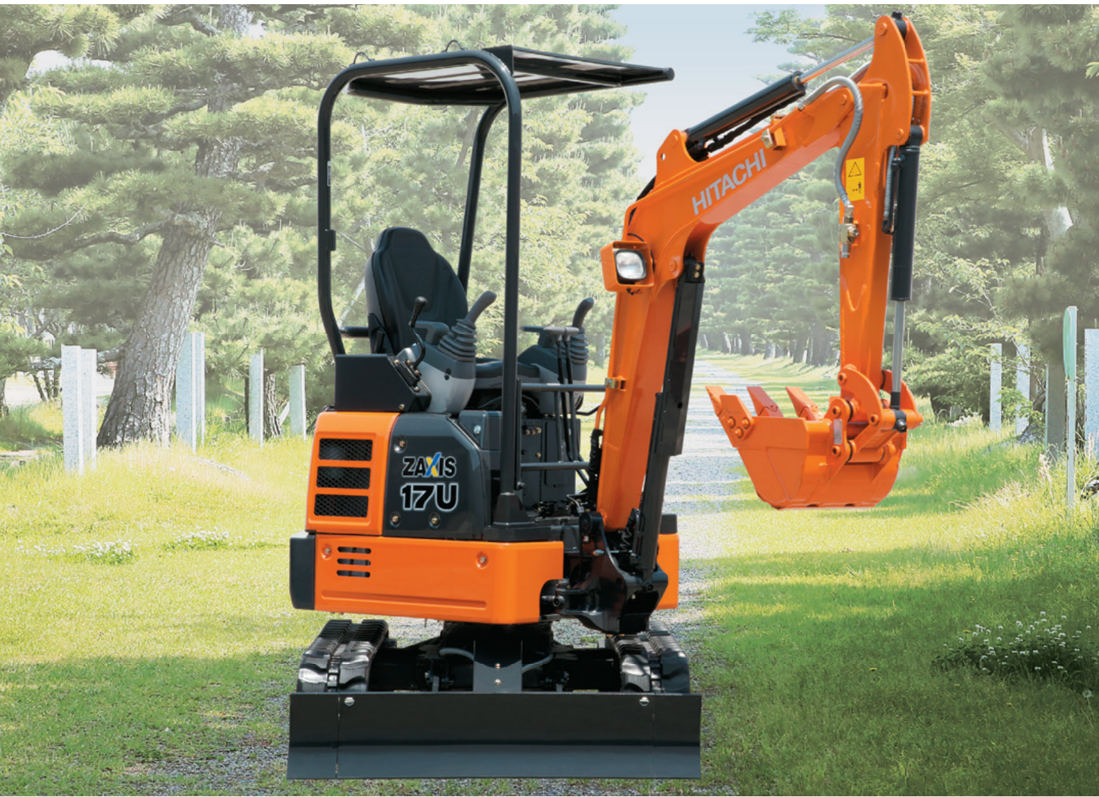
Notes: Standard and optional equipment may vary by country, please consult your Hitachi dealer for details. The machines shown on this brochure are so positioned for the sake of demonstrations. When leaving the machine, be sure to rest the bucket on the ground.